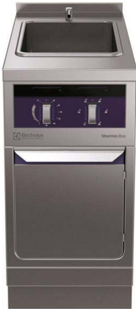
588443 (MABDFBDDAO) Electric AquaCooker+, one-side operated with backsplash, 1/1 GN